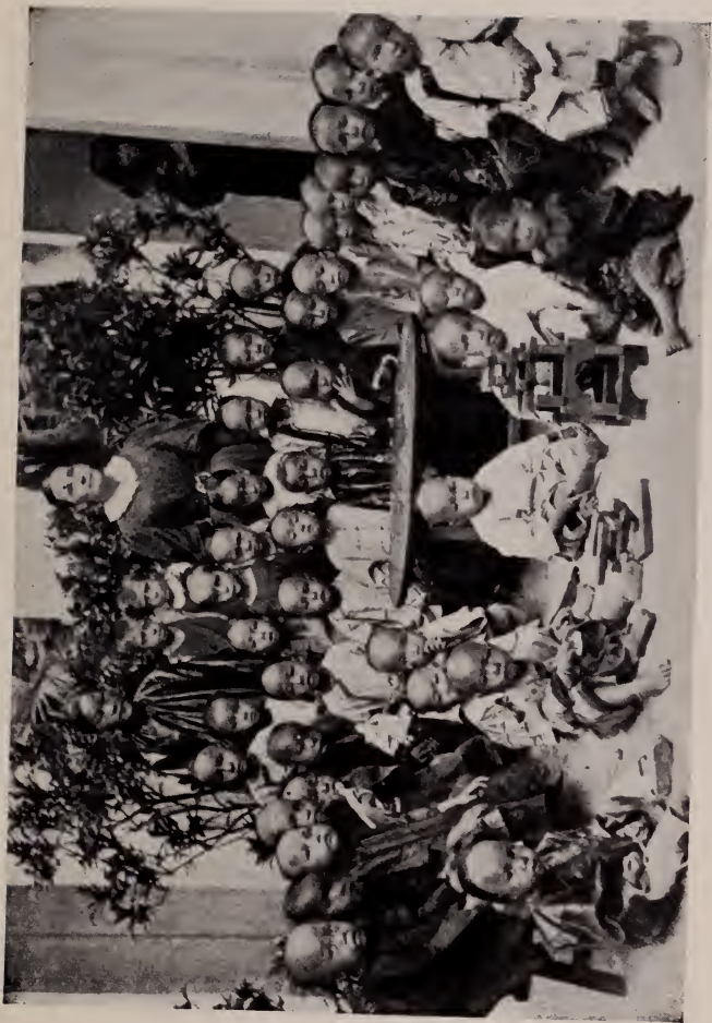
A KINDERGARTEN IN CHINA.